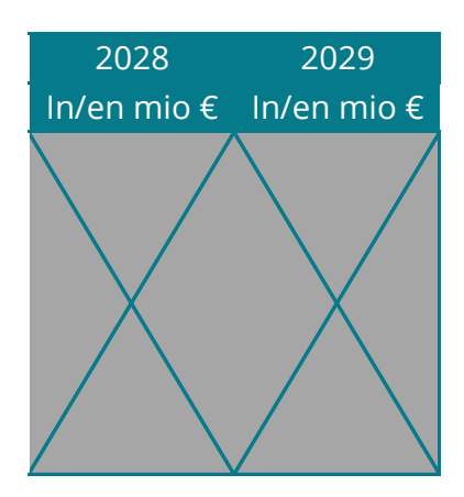
nal. Measures should be e level of revenues or